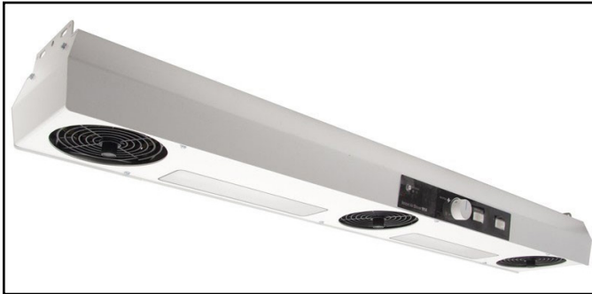
Figure 1. SCS 991A Overhead Air Ionizer

The 991A Overhead Air Ionizer and its accessories are available as the following item numbers: